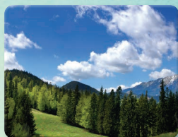
FRESH N CLEAN™