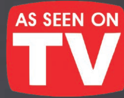
Kevin Harrington Kevin Harrington

Wonder Wafers International is excited to announce our partnership with the one and only Kevin Harrington - widely considered as the Inventor of the now universal Infomercial, as well as the Founder of the 'As Seen On TV' empire. You may also recognize Kevin as one of the original Sharks on the wildly successful 'Shark Tank' TV series!... As an endorser of Wonder Wafers®, Kevin and his highly regarded 'Shark Discoveries' team will be heading up all of Wonder Wafers TV Infomercials as well as all social media and other multi-media campaigns.